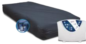
Adapt Line™ Alternating Pressure/ Immersion Support Surfaces