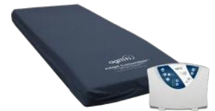
Immerse™ Immersion with Low Air Loss