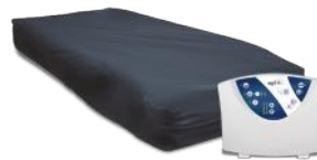
NP Line™ Foam Support Surfaces