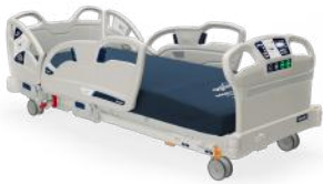
Essentia™ Multi-Acuity Bed Frame